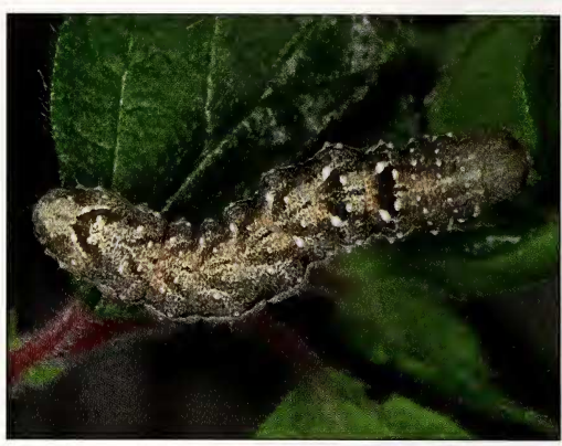
Fig. 15. Last instar larva of Abrostola canariensis Fig. 16. Last instar Larva of Abrostola canariensis (dorsal view).